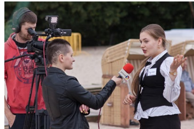
In-character, giving an interview to real media in Sopot. In-game.

Using larp for explicitly political ends is still largely virgin territory. Some of the ideas used in the Baltic Warriors larps came from the wider transmedia framework, while others came to the projects as part of the personal experience of team members who had worked on games such as the Palestinian-Finnish larp Halat bisar (State of Siege, 2013).